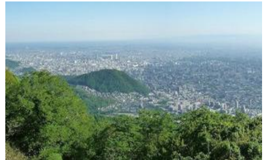
On the Mt. Moiwa trail