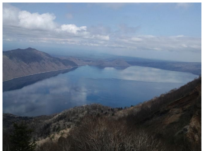
View from Mt. Eniwa